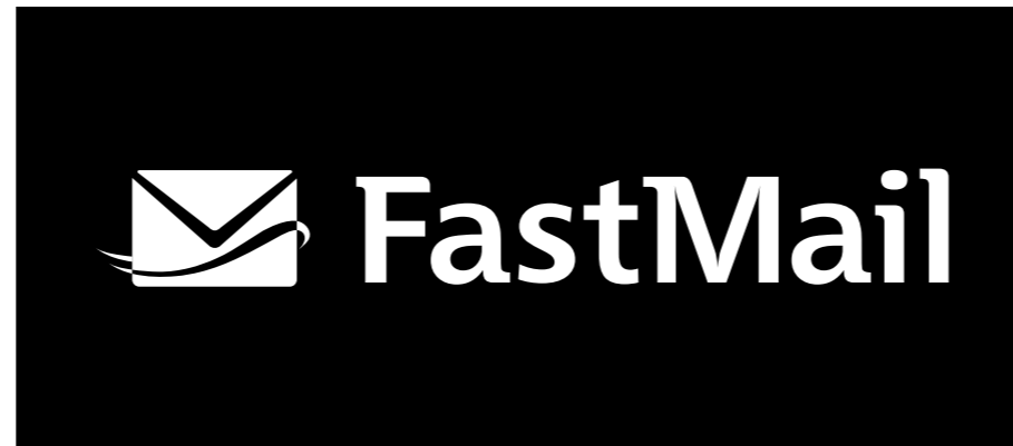
FastMail logo white