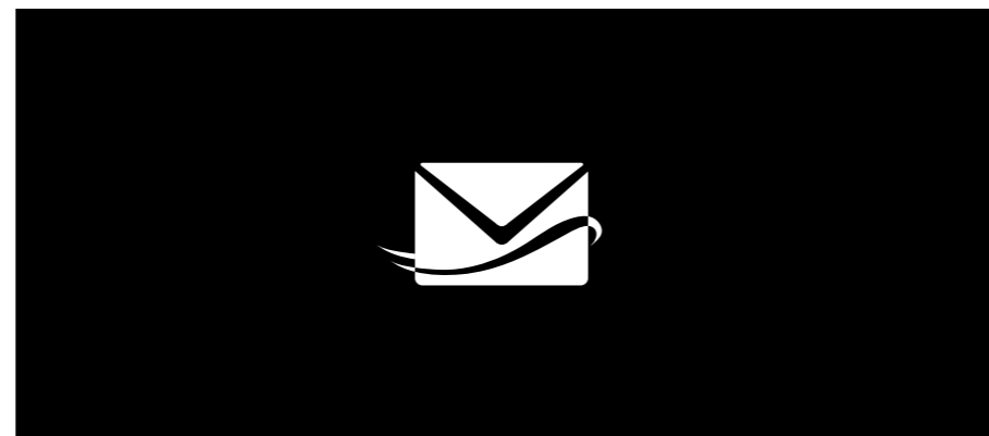
FastMail envelope white