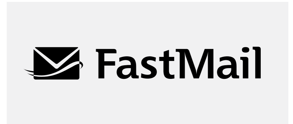
FastMail logo black